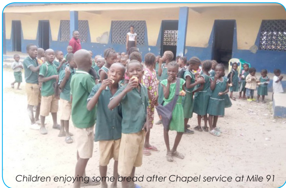
Children enjoying some bread after Chapel service at Mile 91

May the Lord bless you at all times and in every way – even if much of it seems to be restricted, it's never wasted time when surrendered to Him.