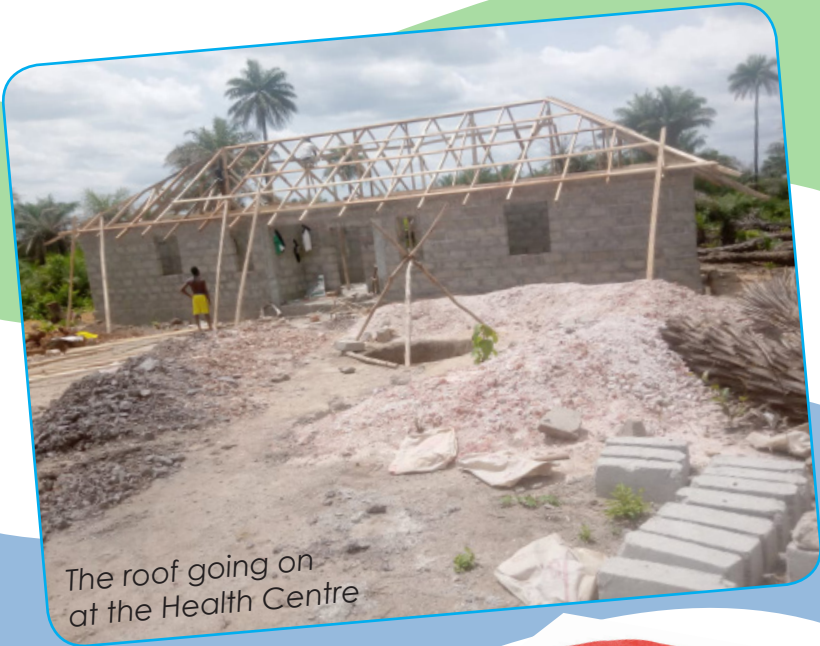
The roof going on at the Health Centre