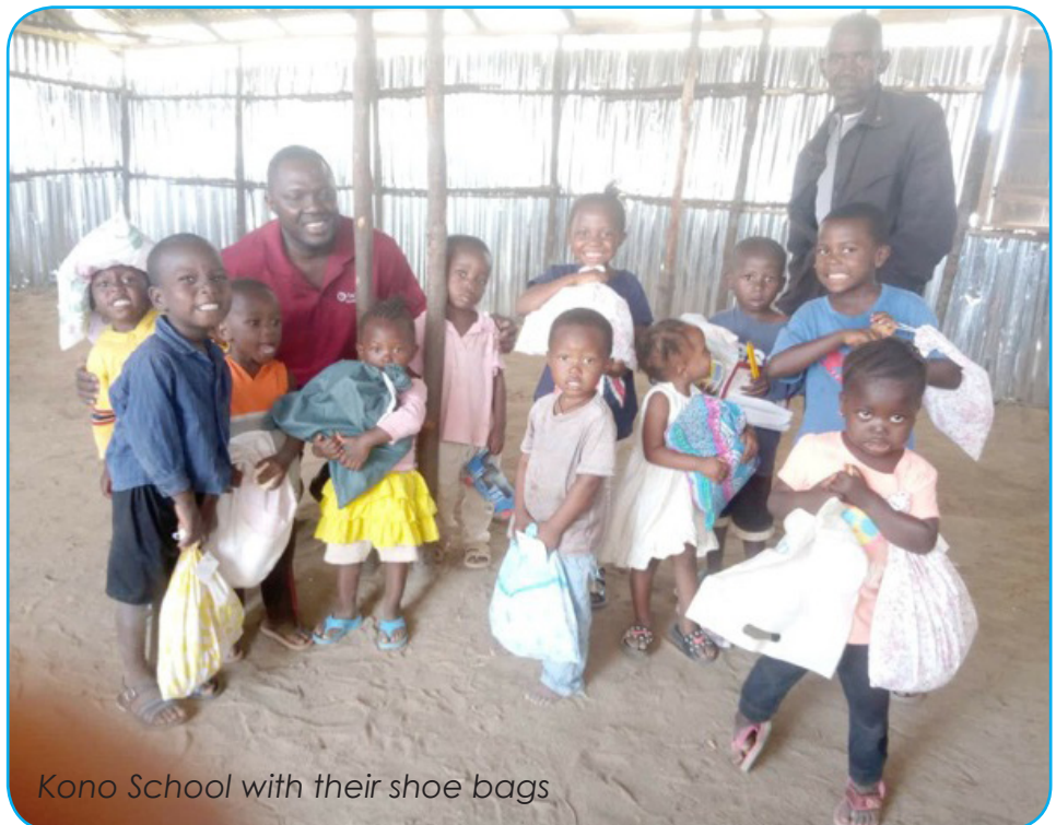
Kono School with their shoe bags